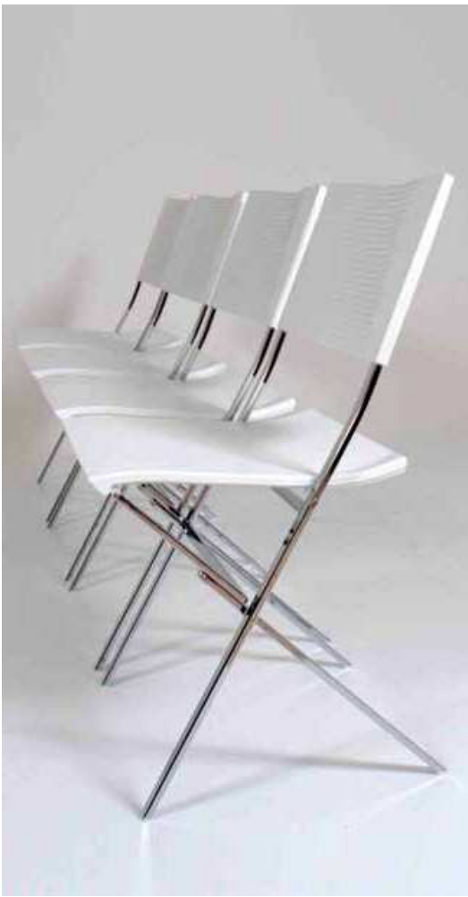
METAL WORK INTERNACIONAL

Chairs Folding tables Hospitality Tables