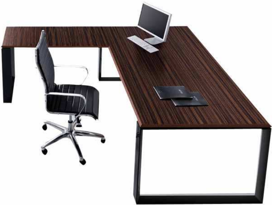
METAL WORK INTERNACIONAL