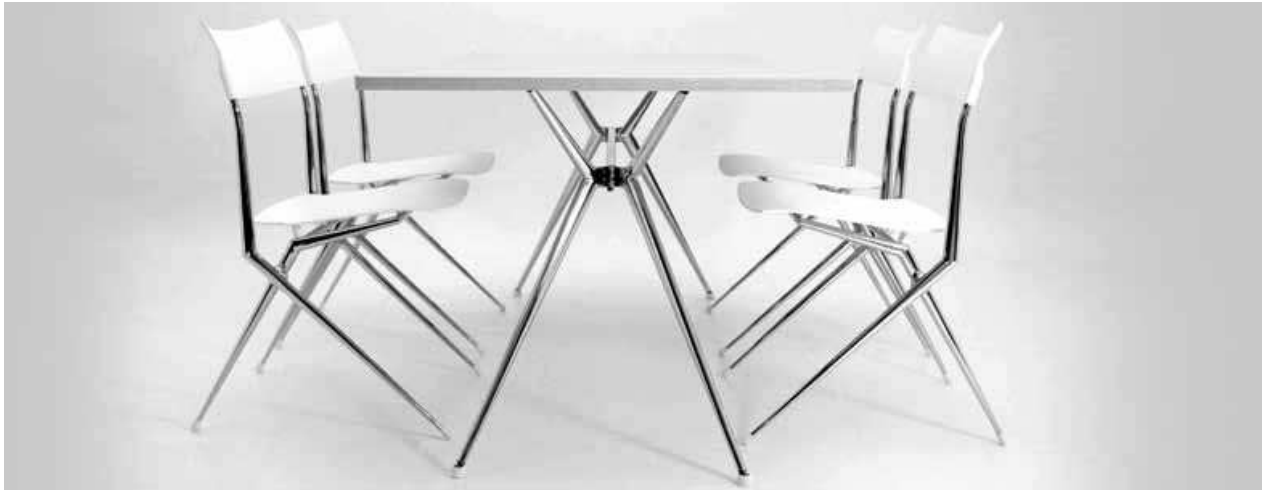
SUPPORTING IDEAS REDEFINING