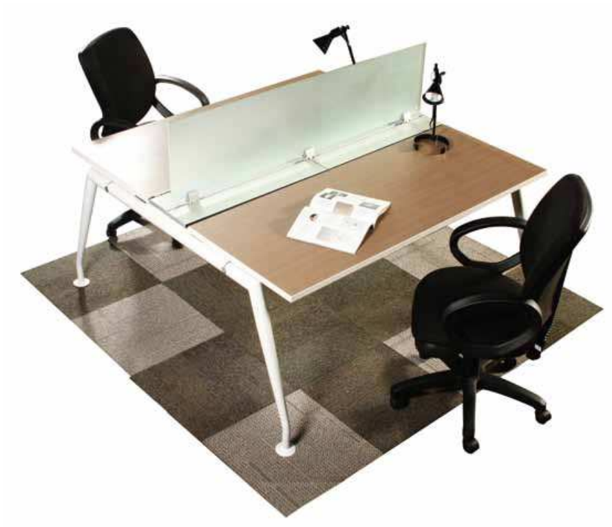
METAL WORK INTERNACIONAL