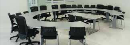
METAL WORK INTERNACIONAL