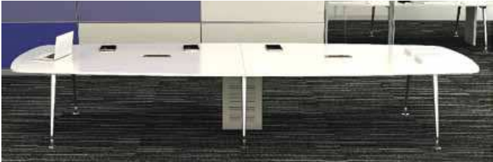
SUPPORTING IDEAS REDEFINING