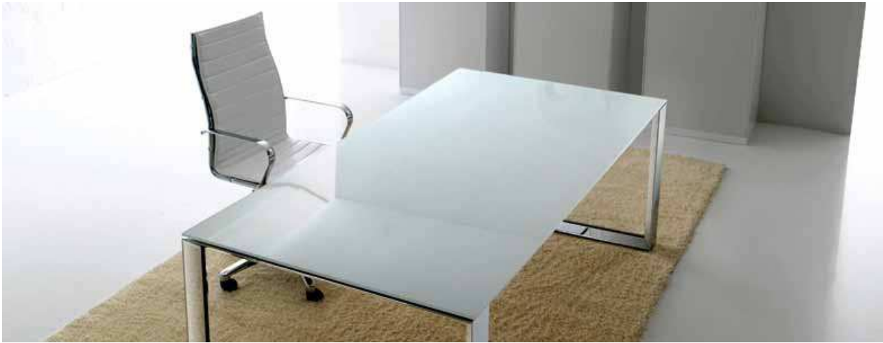
SUPPORTING IDEAS REDEFINING